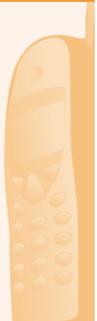
Sketch: Chris Engnoth

1,500 tons of coltan stocks. They forced Congolese farmers off coltan-rich lands and arranged for Rwandan prisoners to mine coltan in exchange for reduced sentences. But coltan is hardly the only "conflict mineral." Armies in the Congo and elsewhere have fought over lands rich in gold, copper, cobalt, diamonds and other gemstones. 63