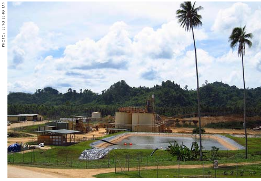
BELOW: Simberi gold mine, Papua New Guinea.

killed fish.<sup>62</sup> The Department of Environmental Conservation ordered the mine to stop milling operations and make repairs, and initiated an independent investigation into the cause and impacts.<sup>63</sup> People on the island have condemned the company for the contamination and reported dead marine life.<sup>64</sup> The New Ireland Provincial Assembly has called on the PNG government to take legal action against Allied Gold.<sup>65</sup>