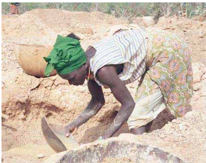
Figure 1. Artisanal gold miner in Ghana. Artisanal mining is often dangerous work. Responsible ASM needs to protect the rights and health and safety of workers.

Several of the initiatives address governance of the group of miners. ARM/FLO and Fair Trade in Gems and Jewelry standards are the only two to note that the group should be community-based and democratic. ARM/FLO standards also indicate that Fair Trade premiums should benefit the community as well as the miners' organization and their partners. CRED indicates a preference for small, local, cooperative structures, in addition to referring to ARM/FLO standards. Fair Trade in Gems and Jewelry also indicates that the organization should be based on the concept and practice of solidarity.