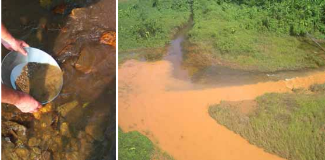
Figure 2. Panning for gold in the Yukon and sedimentation from small-scale gold mining in French Guiana. Siltation can threaten fish habitat and cause massive degradation of streams and rivers. Photos by Janothird and Ludovic Salomon 26 licensed Creative Commons Attribution-Share Alike 3.0