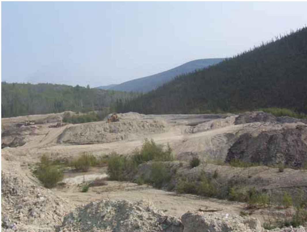
Figure 3. Placer mining in the Yukon. Even small-scale placer mining has the potential to destroy important habitat in river valleys.