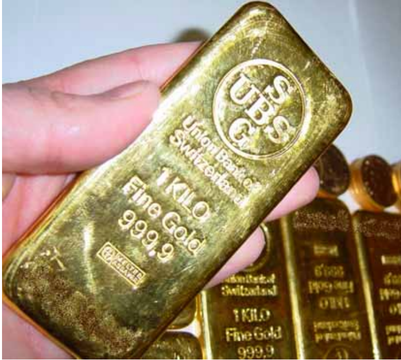
Figure 5. Gold from Swiss bank. Provenance information and traceability are needed to indicate if gold like this contains dirty gold or gold from more responsible operations.