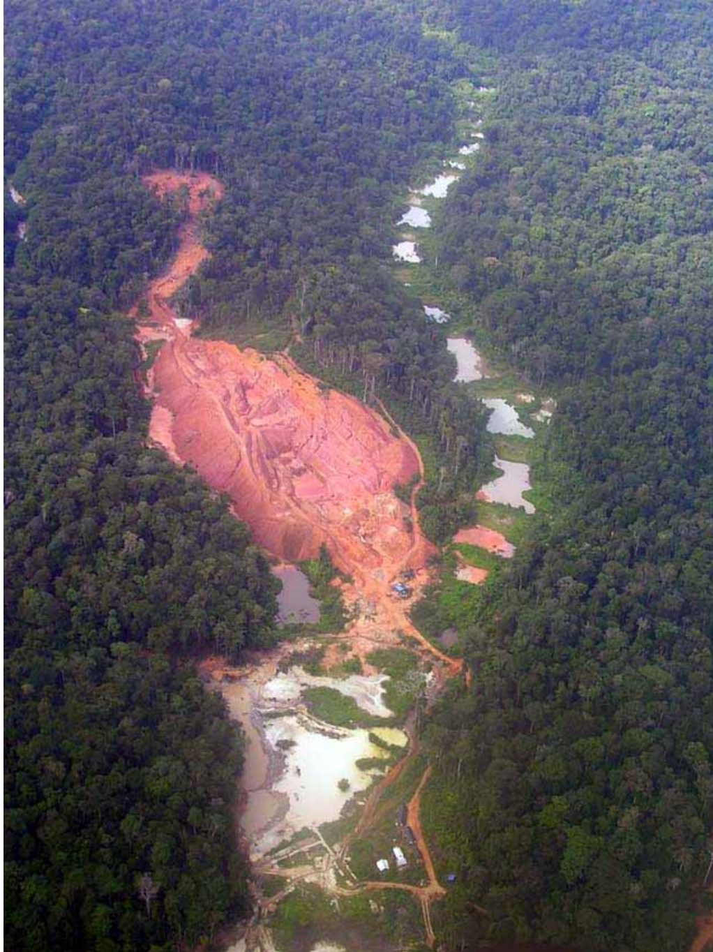
Figure 4. Aerial view of mechanized alluvial and primary gold mining in French Guiana. Mining in sensitive tropical areas can devastate forests, streams, and biodiversity.